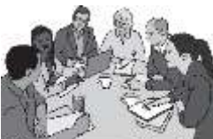
Church Council Meeting